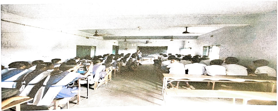
Photographs of the Awareness Programme conducted at Talbona Radharani High School on 1 st March, 2024 with the student of class X.